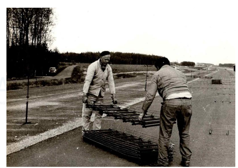
■ 1974 - use of dowels