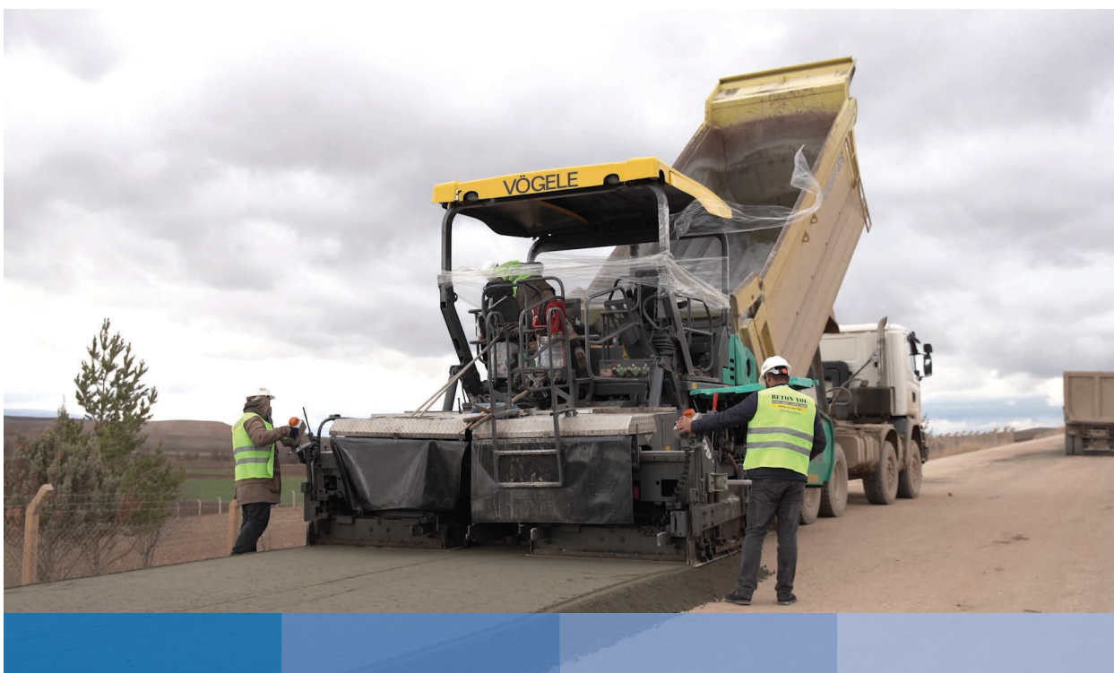
Turkey: construction of a rural road

When using finishers, it is very important that plant output allows a continuous forward motion of the equipment to prevent the formation of bumps and depressions on the final pavement surface.