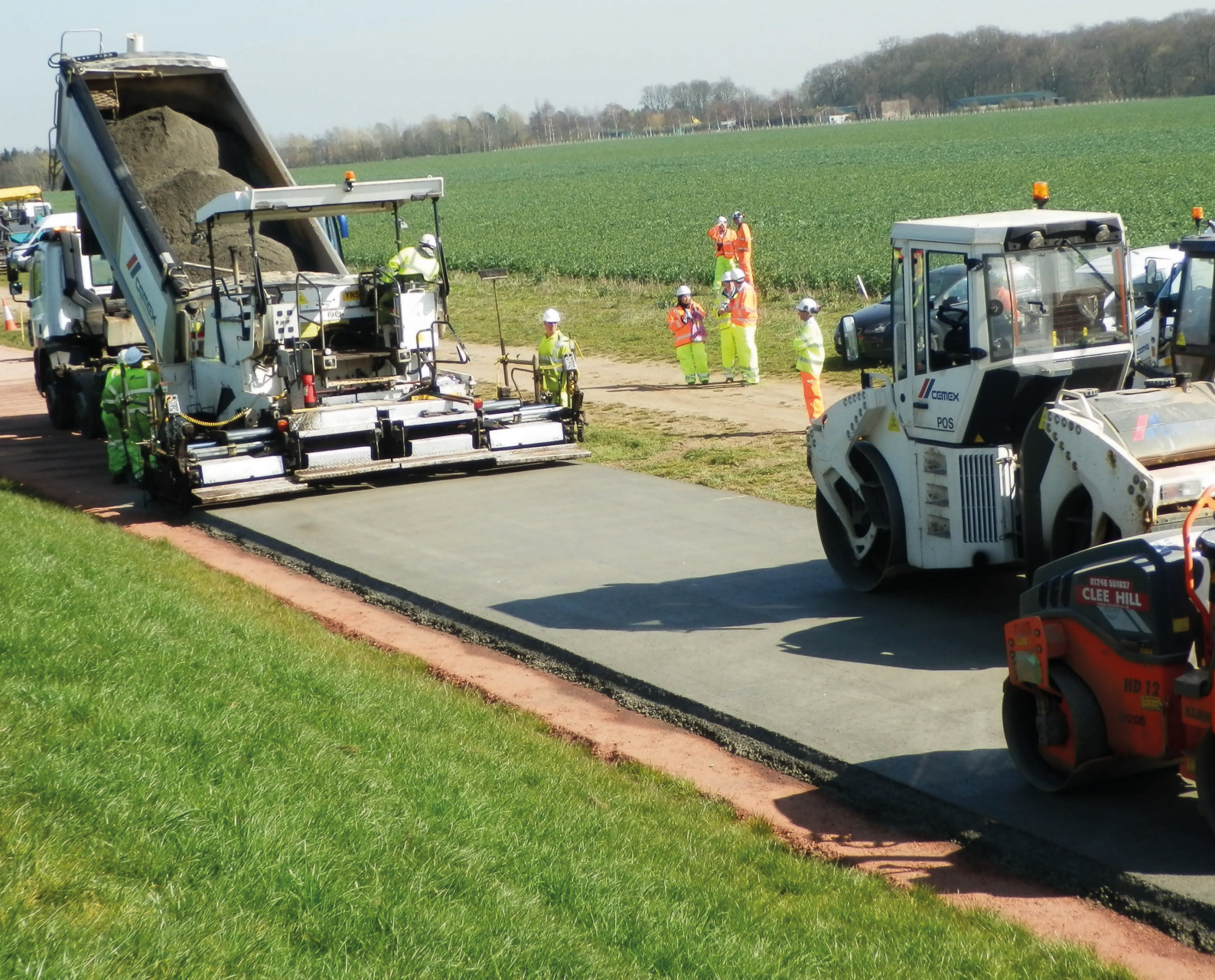
Construction of a RCC road in the UK