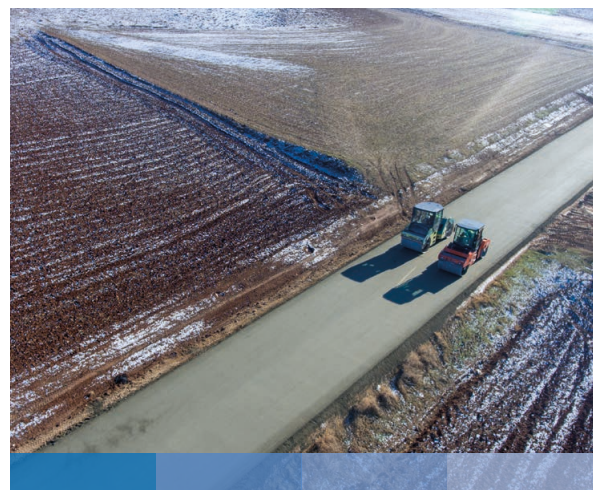
Turkey: Construction of a rural road in RCC

To summarize, RCC has the strength and performance of conventional concrete with the availability of asphalt machinery. Coupled with long service life and minimal maintenance, RCC's low initial cost adds up to economy and value.