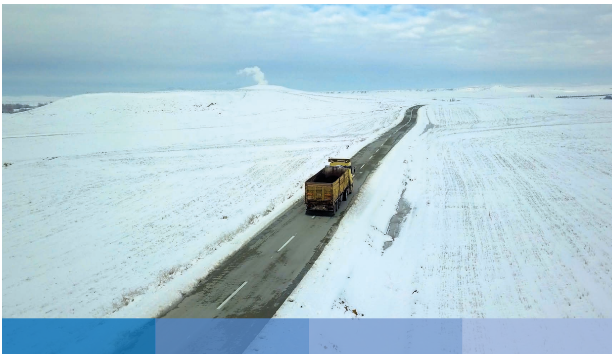
Turkey: rural road in RCC