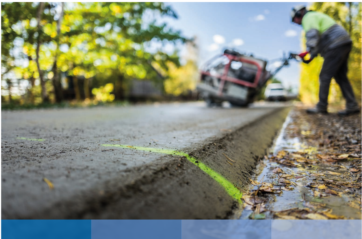
Poland: construction of a rural road – sawcutting of the joints