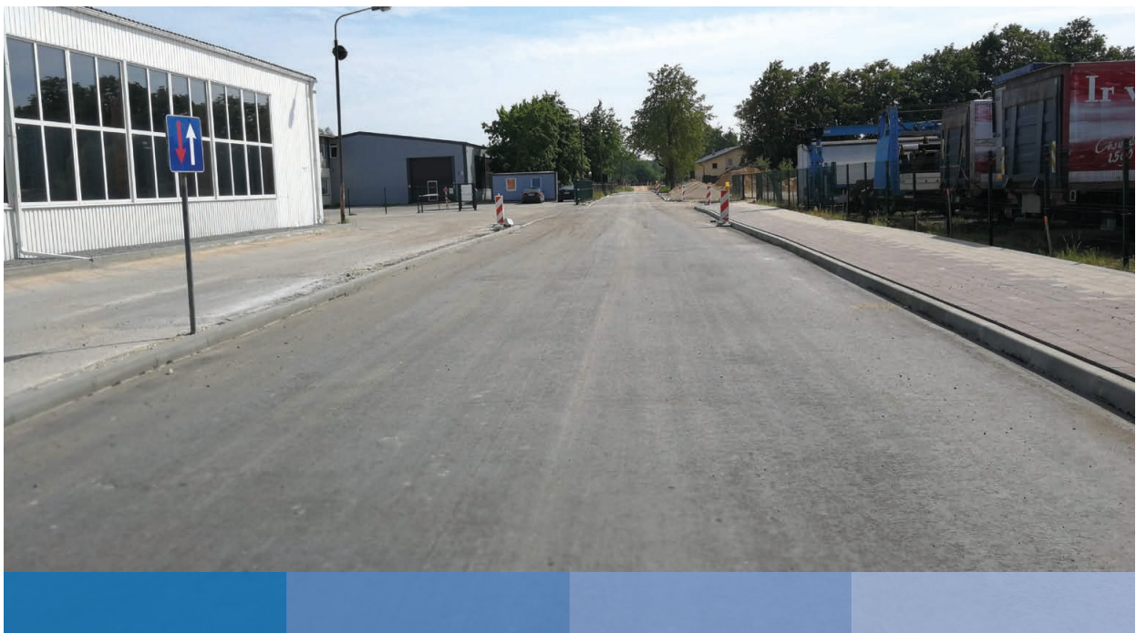
Latvia: RCC street in an industrial area

Also, a significant number of projects have been executed in the last few years, with thousands m 2 RCC built for secondary roads, industrial heavy traffic accesses and roads, service stations, large parking or storage areas, local and rural roads. Although it is a kind of rebirth of this application, it must be said that there are a lot of examples of the great durability of this paving solution, such as rural roads executed in the north of Spain in the 80-90s, currently in perfect working order after nearly 30 years operation.