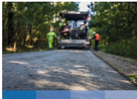
Poland: construction of a rural road

First known modern examples of RCC pavements took place in Spain about 1970, in low-volume roads and streets. In general they have performed very satisfactorily. They were constructed by small local contractors, in a self-taught way. All these facts prove that RCC is a technique that can be easily mastered, since pavements are constructed with machinery usually available and that can be employed for other purposes. Moreover, this easy construction, together with reduced labour requirements and high production rates, results in important savings when compared with other possibilities.