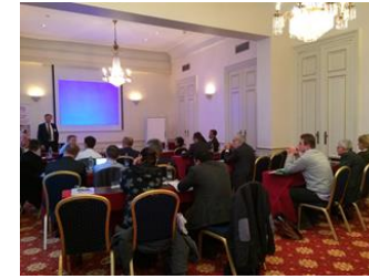
EUPAVE intern workshop