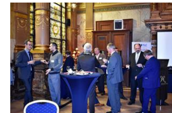
EUPAVE anniversary event